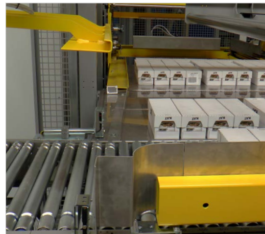
See the MK1 pallet loader in use here