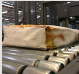
Bags and sacks