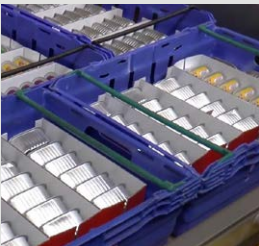
SRS Boxes (reusable plastic boxes)