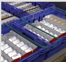
SRS Boxes (reusable plastic boxes)