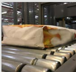
Bags and sacks